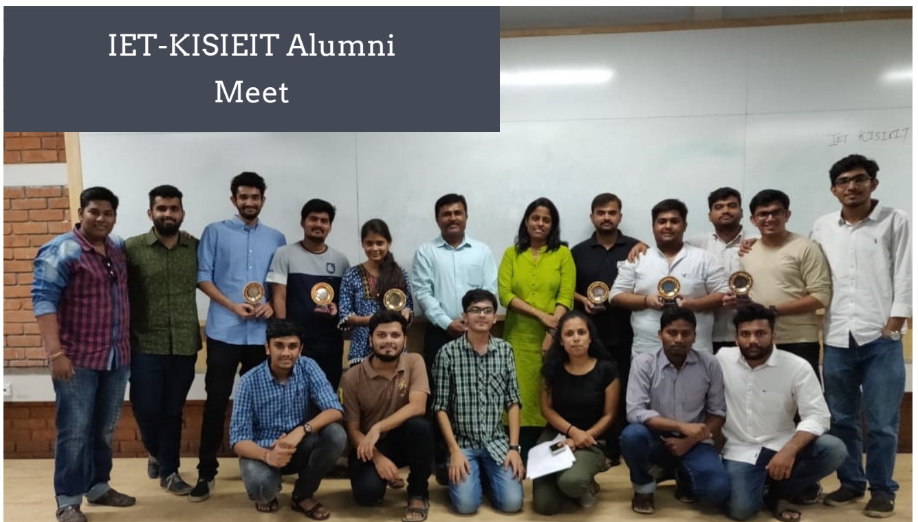
IET-KISIEIT Alumni Meet