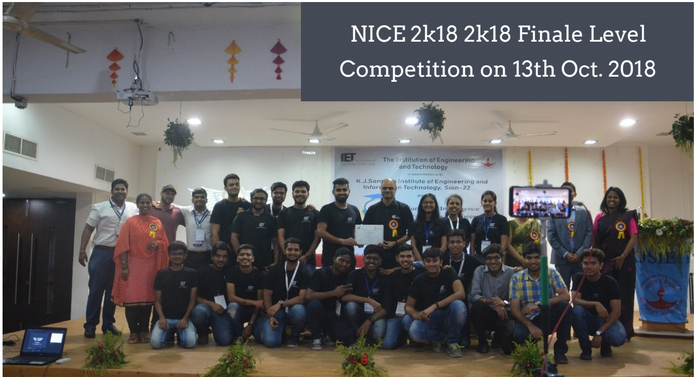
NICE 2k18 2k18 Finale Level Competition on 13th Oct. 2018